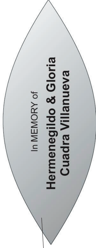
A sample inscription on a leaf.

Indicate how you want to be listed in the alphabetized list of donors in the Interactive Screen ( Example: Smith, John & Mary )